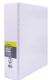
White file for Portfolio (2 ring)