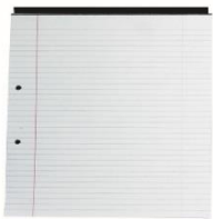
Lined A 4 Paper