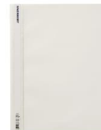
White flat file folder