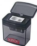
Sharpener that holds the shavings