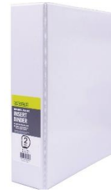
White file for Portfolio (2 ring)