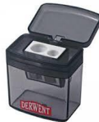
Sharpener that holds the shavings