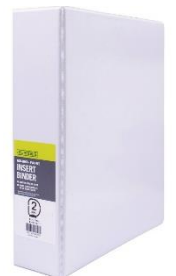
White file for Portfolio (2 ring)