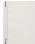
White flat file folder