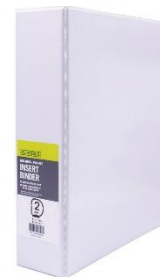
White file for Portfolio (2 ring)