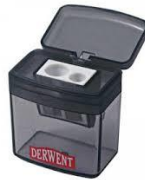
Sharpener that holds the shavings