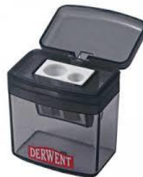
Sharpener that holds the shavings