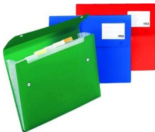
Expandable Folder (5 pockets)