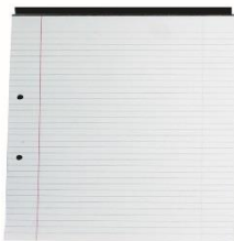
Lined A 4 Paper