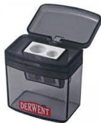
Sharpener that holds the shavings