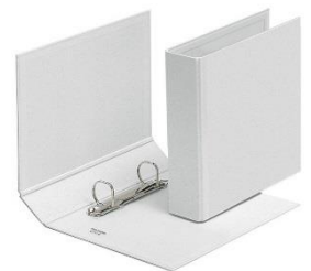
White file for Portfolio